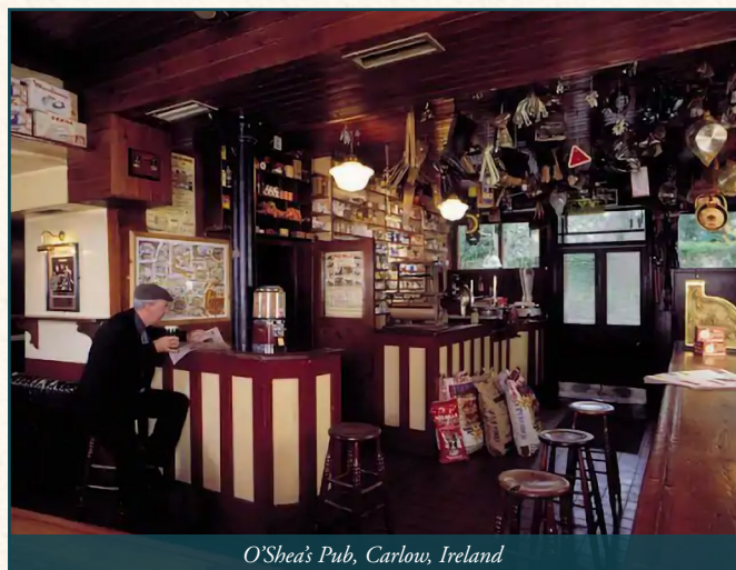
O'Shea's Pub, Carlow, Ireland

Between 1845 and 1855, 1.5 million Irish immigrated to the United States due to the Great Hunger, with many more to follow in the coming decades. The United States already had an established pub and tavern industry that dated back to the very beginning of the colonies, when public houses doubled as meeting halls and court houses due to the complete lack of actual government infrastructure. Eventually the Revolutionary War would be sparked in conversations held in Boston Taverns. When Irish immigrants arrived in the United States they were often told to go straight to the local “Irish Pub.” Their fellow Irish immigrants could help them settle, find work or locate family members. The Irish pub in the United States was just as much a center of community, and oftentimes it was a way to connect with the culture of Ireland and a lifeline back home. Irish immigrants opened pubs in Boston, Chicago, NYC...all over the United States, and eventually all over the world.