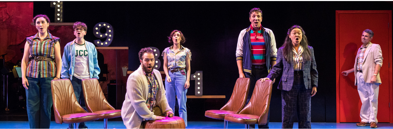
THE CAST OF FALSETTOS (2023).