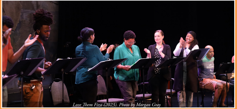
Love Them First (2023).