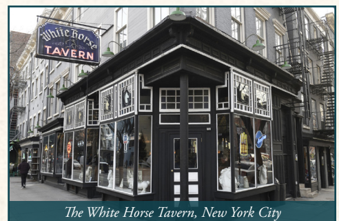
The White Horse Tavern, New York City