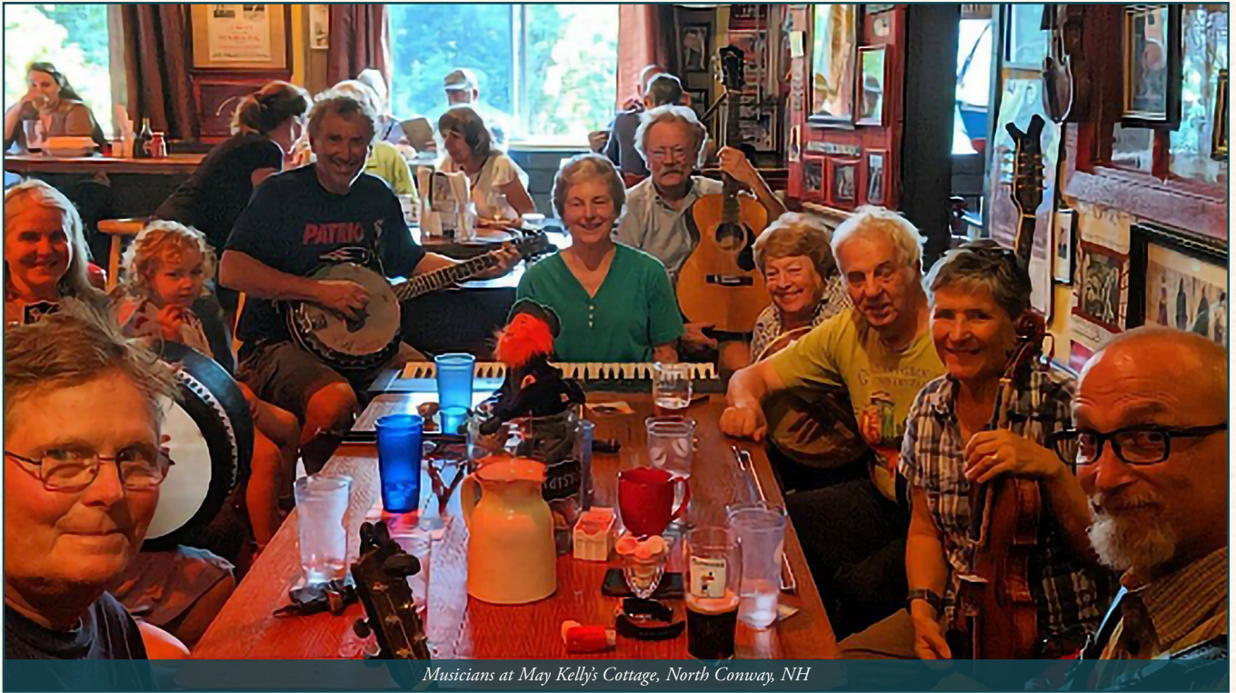
Musicians at May Kelly's Cottage, North Conway, NH

Seisiún (“sessions” in Irish) are informal gatherings of Irish traditional musicians that happen mostly in pubs. They are wonderful, spontaneous musical events that now can be found all around the world. If you were to come across one you would find musicians sitting around a table usually engaged with each other in a way that you might expect them to be having a friendly game of cards. You might even think that they’re a “band” but looks would be deceiving. Lovely bouncy tunes would be coming out of the circle and everyone that’s playing them knows the intricate melodies. And sometimes a song is called for and the room becomes quiet so the song can be heard.