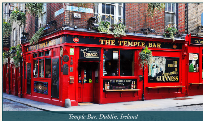
Temple Bar, Dublin, Ireland

By 1760, there were 2,300 public houses (commonly referred to by the shortened version of the name – the “Pub”) in Dublin, a city which became famous for its public houses and their colorful names. Most people during that time period were illiterate, so pubs were identified by the bright symbols on their signs that would eventually become their names. Names like The Flying Horse, The Sots Hole, Three Candlesticks and the Blue Leg. The public house was designed as a place where the common man could enjoy the local community and get a drink.