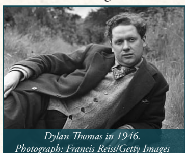
Dylan Thomas in 1946.

In 1945 the producer of the BBC radio program Children's Hour wrote to Dylan Thomas suggesting a talk entitled "Memories of Christmas." Thomas thought that this was "a perfectly good title to hang something on," and by the autumn he had finished work on a reading for the show. Almost five years later,