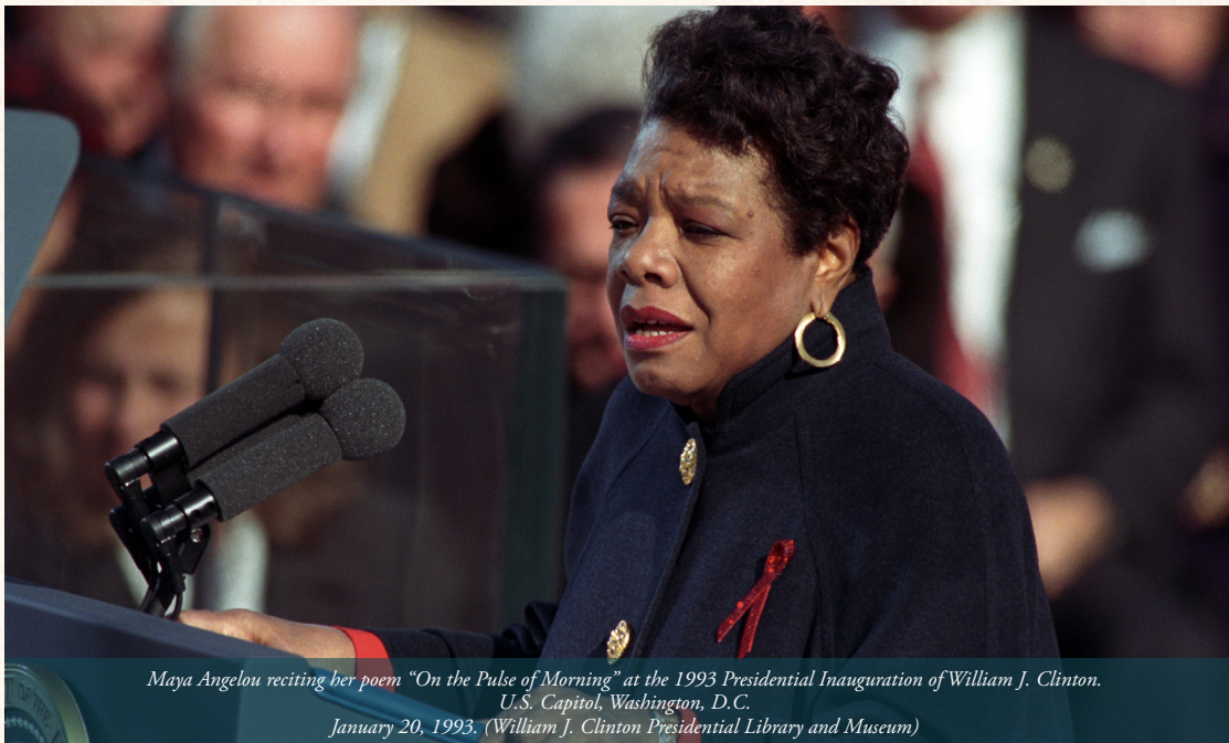
Maya Angelou reciting her poem “On the Pulse of Morning” at the 1993 Presidential Inauguration of William J. Clinton. U.S. Capitol, Washington, D.C. January 20, 1993.

Best known for her autobiography, I Know Why the Caged Bird Sings , Dr. Maya Angelou was also a prolific and widely-read poet, including her poem, On the Pulse of Morning , written at the invitation of President Bill Clinton and read at his 1993 inauguration. Angelou also wrote other “occasional” poems, including A Brave Startling Truth (1995), which commemorated the founding of the United Nations, and Amazing Peace (2005), read by Dr. Angelou at the White House Christmas tree-lighting at the invitation of President George W. Bush, on December 1, 2005.